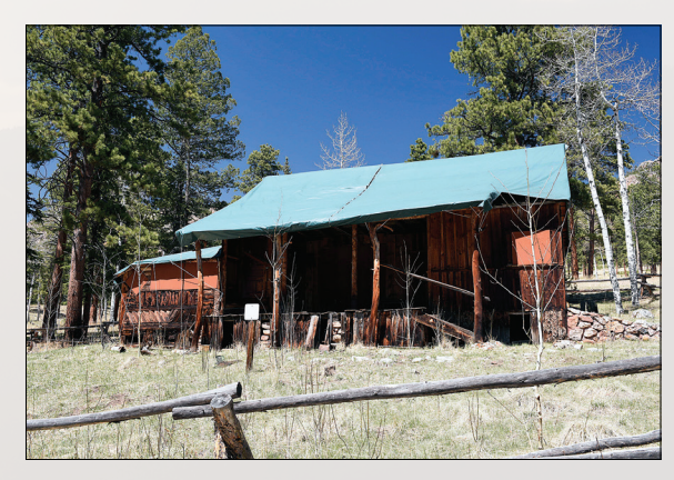
Thanks to funding from the Friends of Staunton State Park, tarps were installed over the cabin roof in May 2020 to slow further deterioration to the Staunton Homestead Cabin

Friends of Staunton State Park is a 501(c)(3) charitable organization.