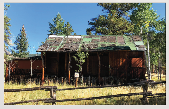
The Staunton Homestead Cabin in 2019.